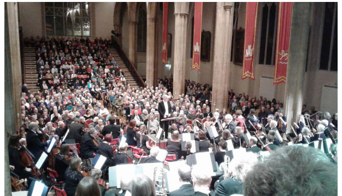
Great performance of Verdi Requiem to sellout audience!