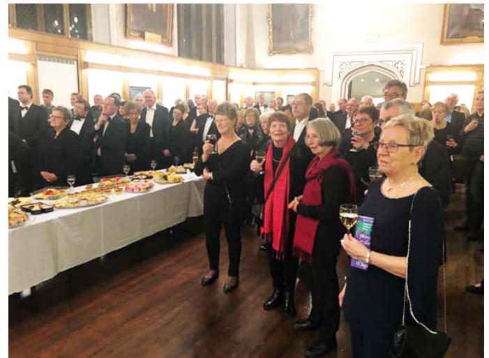
Post concert reception buffet and speeches.