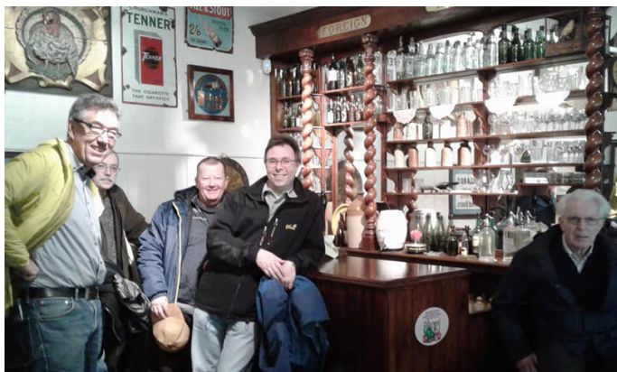
...and to Museum of Norwich in the Bridewell