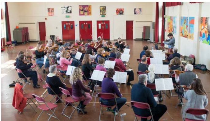
Strings at the Philharmonia Workshops