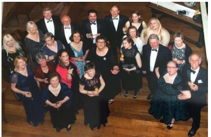
Cheery smiles from the 175th Anniversary Ball