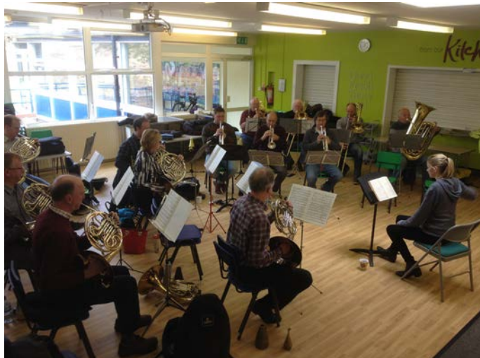
Brass Workshop with the Philharmonia