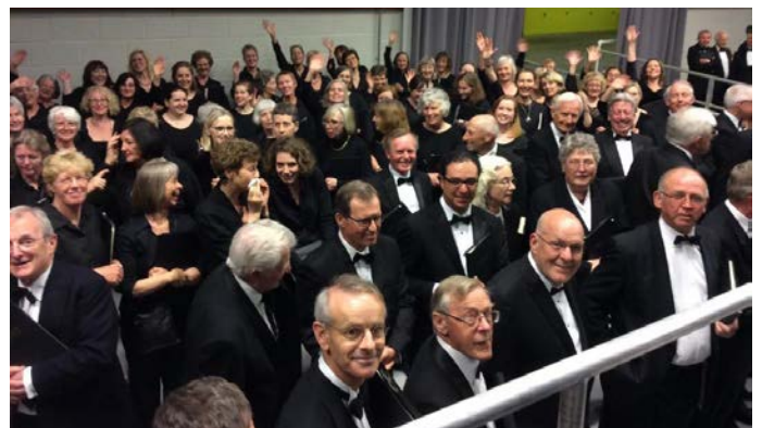
Choir waiting to go on