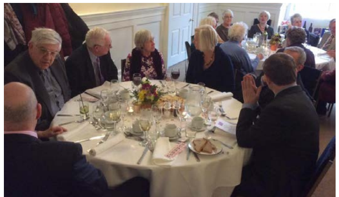
175th Anniversary Lunch

The glittering Ball in the music room at the Assembly House was a great success, even with lower than expected ticket sales. Members dined on 5-star food washed down by excellent wines. They danced the night away to the terrific band, The Fuzz, who said we were the best sing-along audience they had ever had!!!