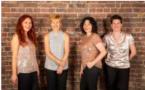
The Brook Street Band