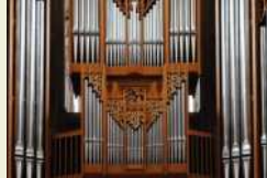
The Collins organ

St Peter Mancroft offers a range of singing opportunities including Choral Scholarships – details on the next page.