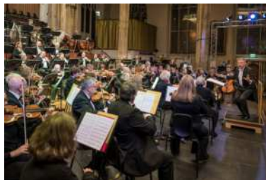
Norwich Philharmonic Orchestra

Tickets: £20, £14 (£8 Students/Under 26)