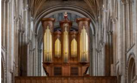
Norwich Cathedral organ which has been recently refurbished