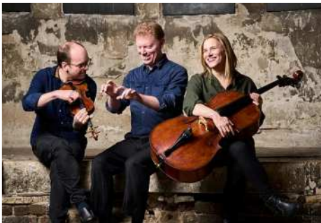
The Leonore Trio, who will open our 2024/25 Season in September.