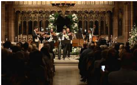
The Four Seasons

London Concertante is an ensemble that has captivated audiences around the world with their unique and enchanting Candlelight Concerts for more than three decades.