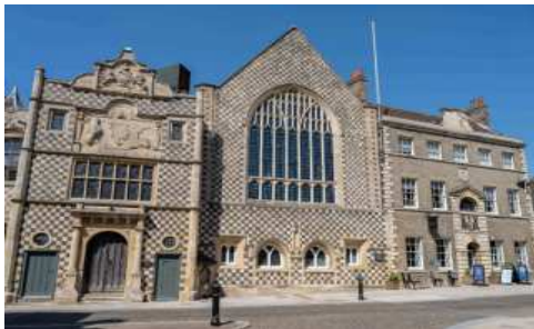
King's Lynn Town Hall, Saturday Market Place

King's Lynn Festival bursts into life from 14-27 July 2024 with captivating music and dance, thought-provoking talks, engaging cinema screenings, enriching guided tours, and a plethora of other vibrant events using the many stunning venues in King's Lynn.