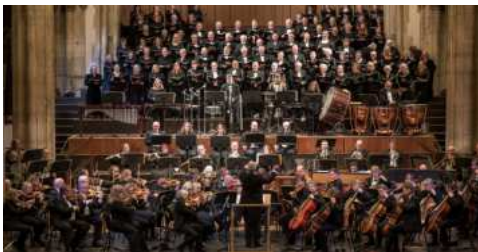
Norwich Phil Orchestra and Chorus at The Halls, Norwich

For its final concert of its 23/24 season, the Norwich Phil heads to the Norfolk Events Centre (formerly known as the Norfolk Showground Arena) for a night of popular and classic film music.