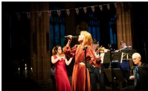
West End Musicals

More details and booking for all concerts at https://londonconcertante.com