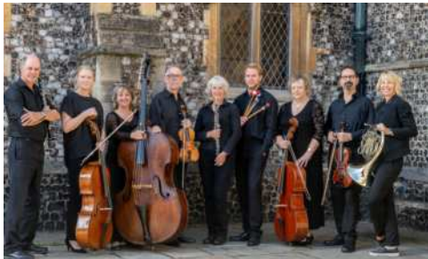
Academy of St Thomas 2019

The Academy of St Thomas was founded in 1973 and has been promoting high calibre concerts in the region ever since. The players of the Academy are drawn from professional musicians and peripatetic teachers who donate their talents in order to play in a high-standard orchestra. Concerts have been acclaimed for their high professional standards and exhilarating performances.