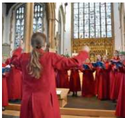
St Cecilia Singers