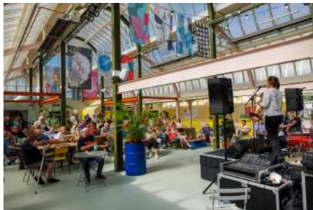
East Pint Beer Festival August 2022

There's a wide variety of delicious food from independent street food traders within the Pavilion - currently Gannon's Pie and Mash, Slice, Taaj and new in May will be The Grub Shack offering a wide menu from loaded fries to burgers and breakfast rolls. And the bar is run by Sir Toby's Beers, serving the most easterly pint. The Pavilion hosts regular events including concerts and live music evenings and open mic nights as well as pop-ups, vintage and makers markets and much more. As the programme varies, please check the events page on the website for up-to-date information.