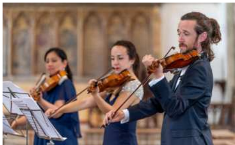
European Union Chamber Orchestra