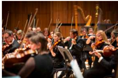
The Royal Philharmonic Orchestra

The 2024 King's Lynn Festival is brought to a magnificent close with The Royal Philharmonic Orchestra and a performance of Elgar's Cello Concerto and Dvořák's Eighth Symphony .