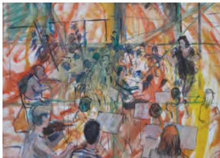
Dvořák rehearsal

The Assembly House hosts the Music at One series of lunchtime concerts which feature the talents of UEA School of Music faculty, students, alumni and visiting artists.