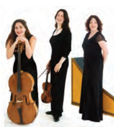
Brook Street Band