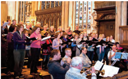
Keswick Hall Choir