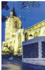
St Peter Mancroft Church