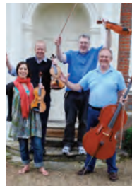
Cavick String Quartet

Dvořák Quartet no 12 in F major Op 96 'American'